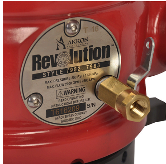
Drain valve for Revolution firefighting intake valve